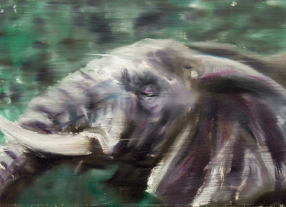
Tiziana Pers, Elephant Song Fluorite 2016, oil on canvas, 30 x 40 cm, courtesy aA29 project room